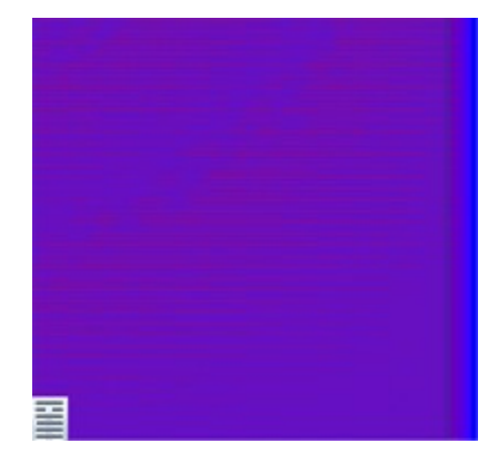
Figure 4: Equal alternations of 'yin' and 'yang' changes beginning with 'yang' (blue)

The head chakra in the I Ching is violet, while red is associated with the one lowest to the earth, the pubic chakra. There are also some mathmatical correlations: to get blue or red as an end result, one needs equal alternations of 'yin' and 'yang' changes, as in figure 4.