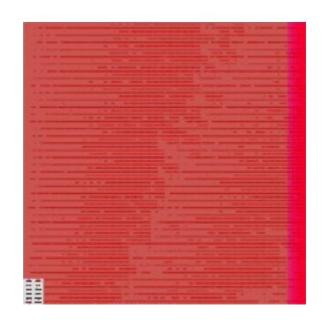
Figure 3: A pure 'yin' hexagram.

The I Ching associates aspects of the mathematical (yin/yang chance) or natural world with meanings.